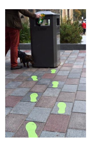
An example of the green footprints laid out in a walking design towards the bins from Darlington Borough Council

Keep Britain Tidy recommends that practitioners use photos or drawings to make the intended layout of the footprints clear to staff installing them.