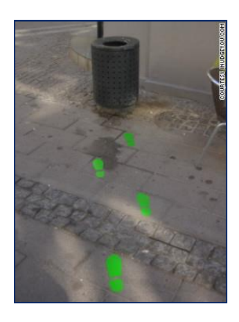
The green footprints in situ in Copenhagen

The experiment was conducted at two locations per partner area: one park/recreation area and one main retail and commercial area. This allowed the effectiveness of the footprints at different land use types to be tested.