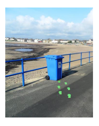
Green footprints in situ at Newbiggin by the Sea promenade, Northumberland

Another consideration is that this site was the only site in the experiment that uses wheelie bins, as opposed to open-top style litter bins. Keep Britain Tidy research has shown that people do not like to use bins where they might have to touch the bin or other people's litter, and the bins at this site may explain the difference in results found here, yet, once again, we do not have data to confirm this at the Northumberland experiment location and this does not explain the increase in litter following the installation of the footprints.