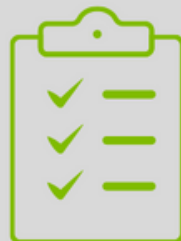
Sign-in sheet (and pens)