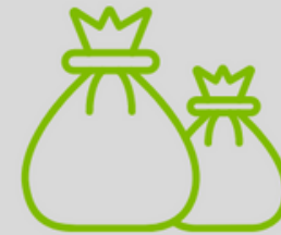
Bin bags and bags for recycling