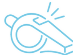
Whistle or loud hailer