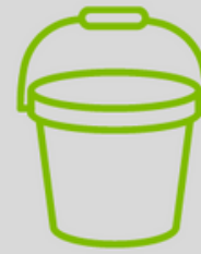
Buckets for sharp objects